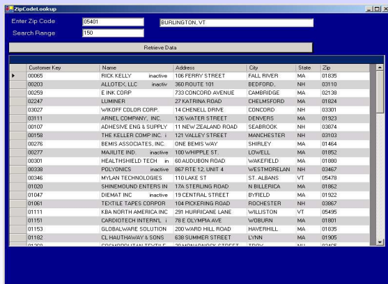
Zip Code search results

An authorized reseller for Sage Software, DBS and its developers and experienced professionals are dedicated to developing client focused solutions.